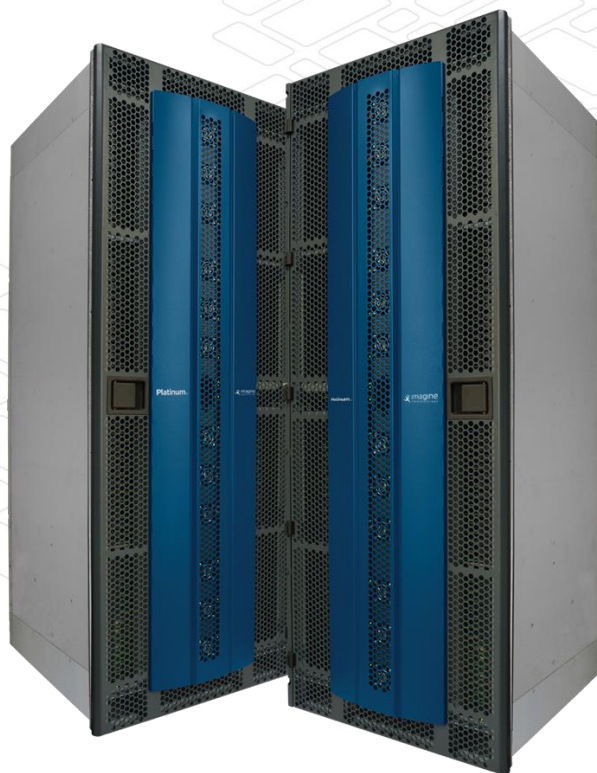
28RU Model Shown

IP3 is designed for in-service on-air matrix expansion. With a powerful, operator-friendly control system, set up and reconfiguration can be seamlessly executed. The IP3 features redundant crosspoints, protecting all mission-critical signal paths. IP3 supports the full range of SDI video formats from Standard-Definition (SD) all the way to Ultra High Definition (UHD) signals.