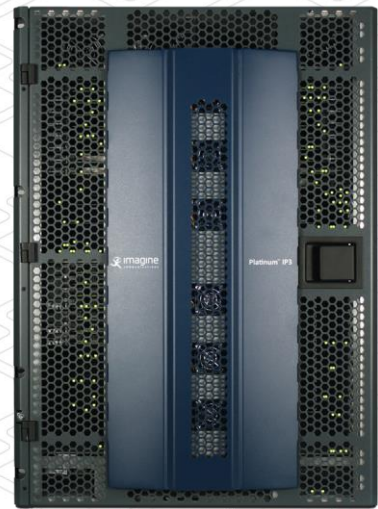
15RU IP3 Frame